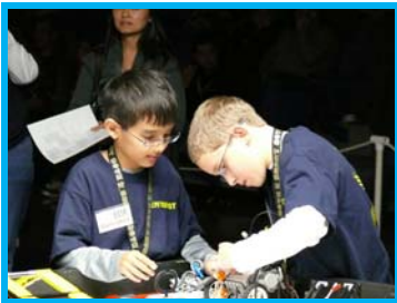
High Flyers members working on their robot during competition

Recognition Award to be presented to the team whose research best represented the center's mission. The team winning the MBTC award was "High Flyers" from Batesville, AR. Their research project focused on the security of the bridge that spans the White River and connects Batesville and Southside. The team was concerned that in the event of a natural disaster or terrorist event, the loss of the bridge would create a dangerous situation for the community by impeding emergency evacuation and movement of emergency personnel between the two communities. They investigated several alternative solutions and proposed the purchase of a pontoon bridge to be used during emergency situations.